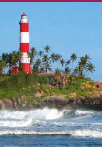
Light House, Kovalam